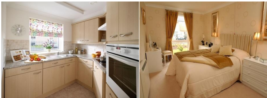
EXAMPLE INTERIOR PHOTOGRAPHS